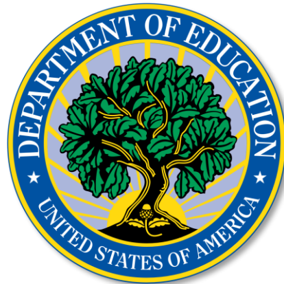
US Department of Education