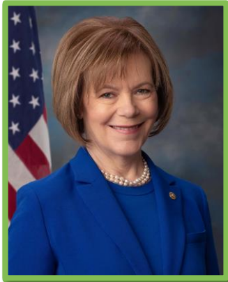
Senator Smith Overview